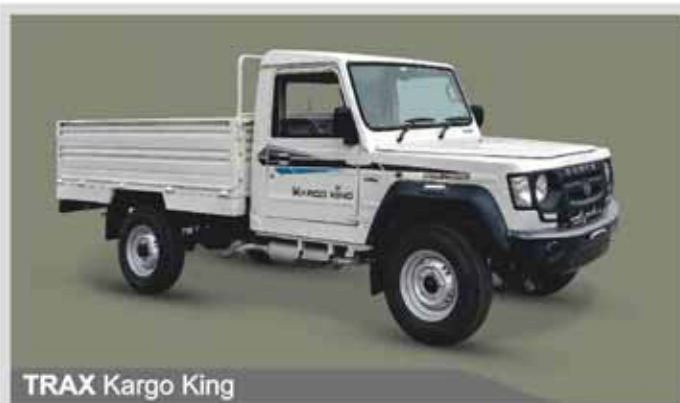
TRAX Kargo King