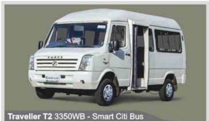
Traveller T2 3350WB - Smart Citi Bus